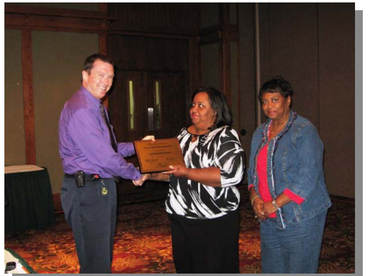
Wayne County Health Department