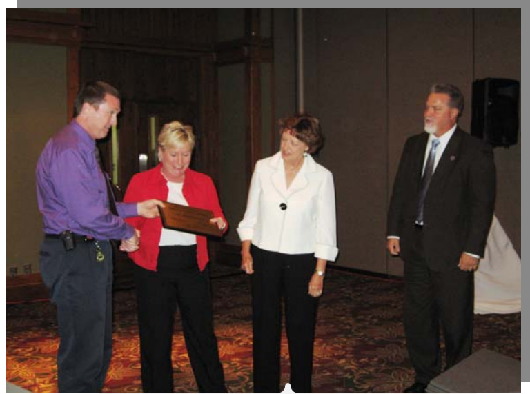
Madison County Health Department