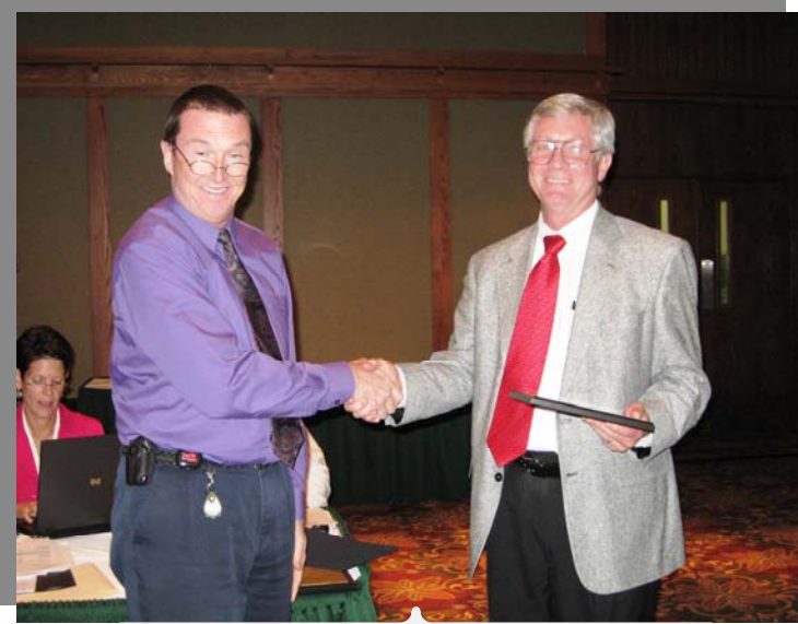
Forsyth County Department of Public Health