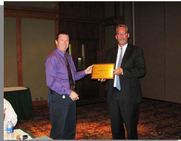
Transylvania County Department of Public Health